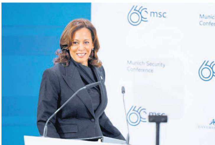
United States Vice-President Kamala Harris prepares to address the audience during the Munich Security Conference at the Bayerischer Hof Hotel in Munich, Germany, Friday, Feb. 16, 2024.

Speaking at the Munich Security Conference, Harris offered a broad defense of the Biden administration's approach to global challenges, especially in lead-